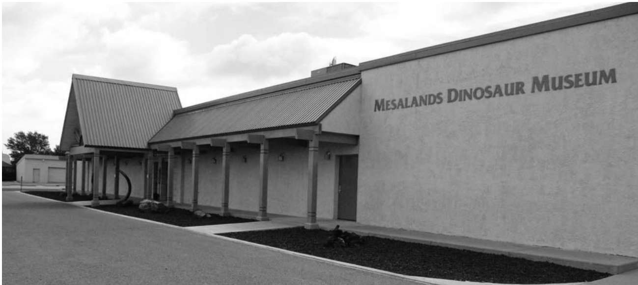
Mesalands Community College's Dinosaur Museum (Building F), above.